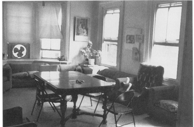
4. The lounge where the women congregate during free time.

are filled with food donated by local supermarkets and residents of more affluent neighboring communities. Since all donated goods are accepted by the sisters, the entire basement is filled with a "potpourri" of food and other items, such as deodorant, toys, and shampoo.