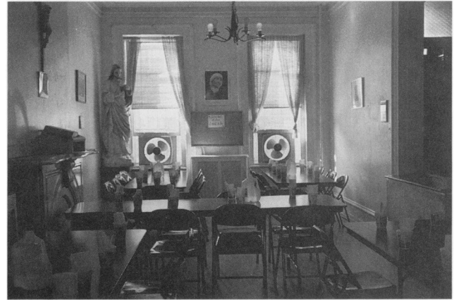
2. The dining area before dinner is served.