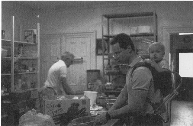
3. Volunteers preparing the evening meal.